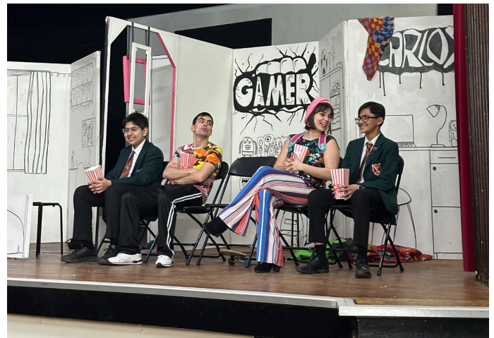
Volunteers at Vyners playing extras in the Spanish play by Onatti Productions

At Vyners, Year 9 students, together with Key Stage 4 classes, also enjoyed plays for their respective languages from Onatti Productions, a company which writes accessible live theatre to complement students' foreign language development. Key Stage 3 students were also treated to a workshop led by the school's language ambassadors on constructed languages from the world of fiction.