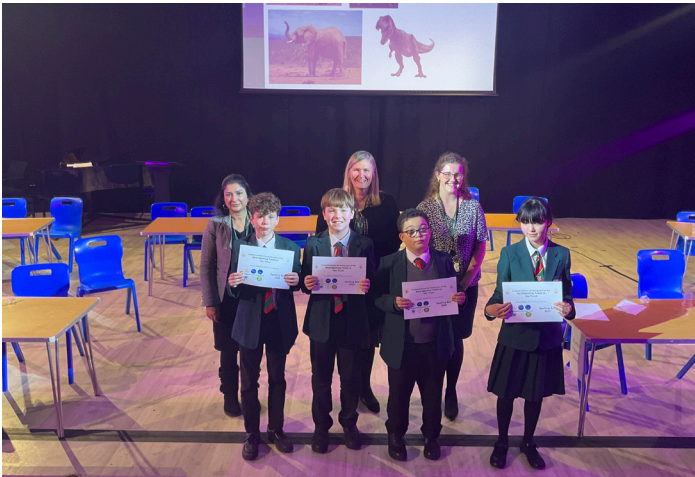
Vyners' winning spelling bee team

afternoon was a huge success, offering all the schools an excellent opportunity to learn, collaborate with others and develop their confidence