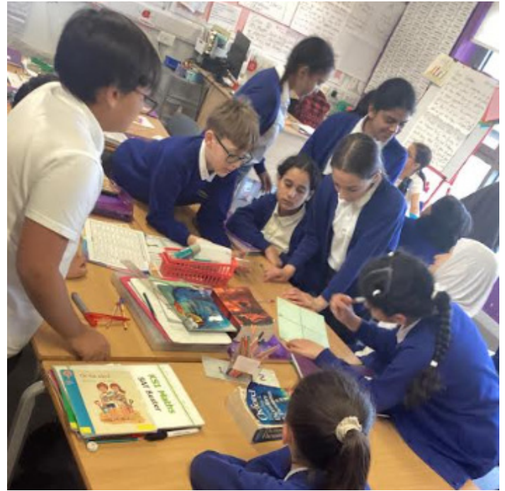
Year 6 students at Hermitage discussing inclusive language

'During equality week, I enjoyed our PE lesson. We played a game called 'cross the river' but we could only use body language and actions to communicate with each other. When we got to the other side, we