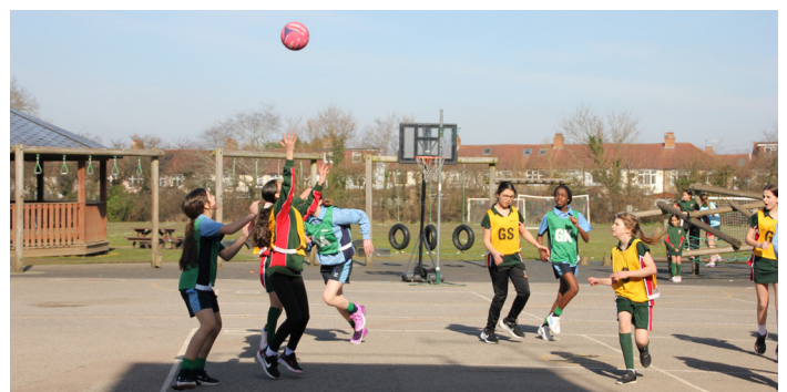
Vyners' and Ruislip High's girls' teams in action

Each team demonstrated excellent teamwork, resilience and positivity throughout the afternoon, which resulted in Vyners earning both the mixed and girls' team trophies. Ruislip High was in second place in each league, with Oak Farm and Hermitage placed third in the mixed and girls leagues respectively. Every school represented the Trust admirably and the students are looking forward to future Trust-wide events.