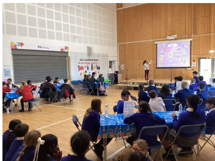
Students taking part in the science challenge