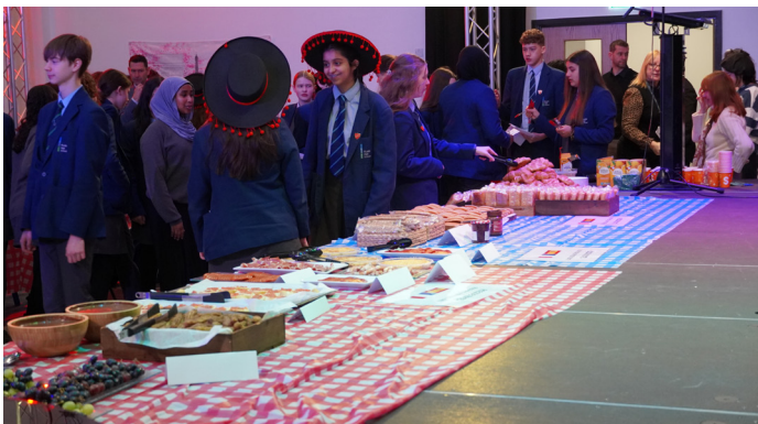
Ruislip High's students at the languages breakfast

There was also a Year 9 languages breakfast which was hosted by the Year 10 language ambassadors. The event was attended by over 130 students and was a resounding success. Students enjoyed an array of French and Spanish food, ranging from croissants to churros.