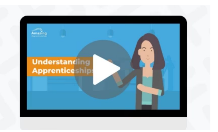
How to apply video link link