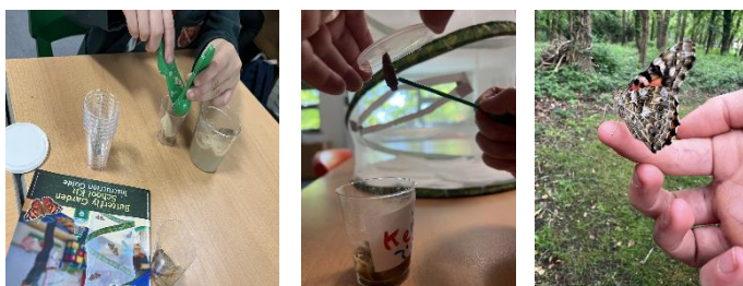
Learning Support Team

During this half term, a number of students within Learning Support helped with a project - nurturing caterpillars and watching them transition into chrysalis state and then finally into butterflies which they then later released. During this process the students monitored and observed the changes that occurred and then later released the 'Painted Lady Butterflies' into the wild. The students enjoyed observing the transformation take place and were fascinated by the transformation of a caterpillar into a butterfly.